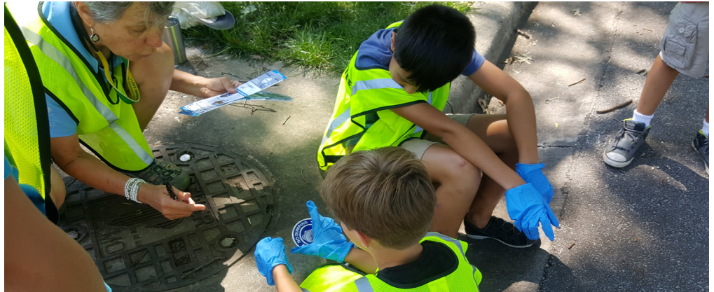
KC Water provides supplies and training so students and community groups can mark storm drains with special medallions.