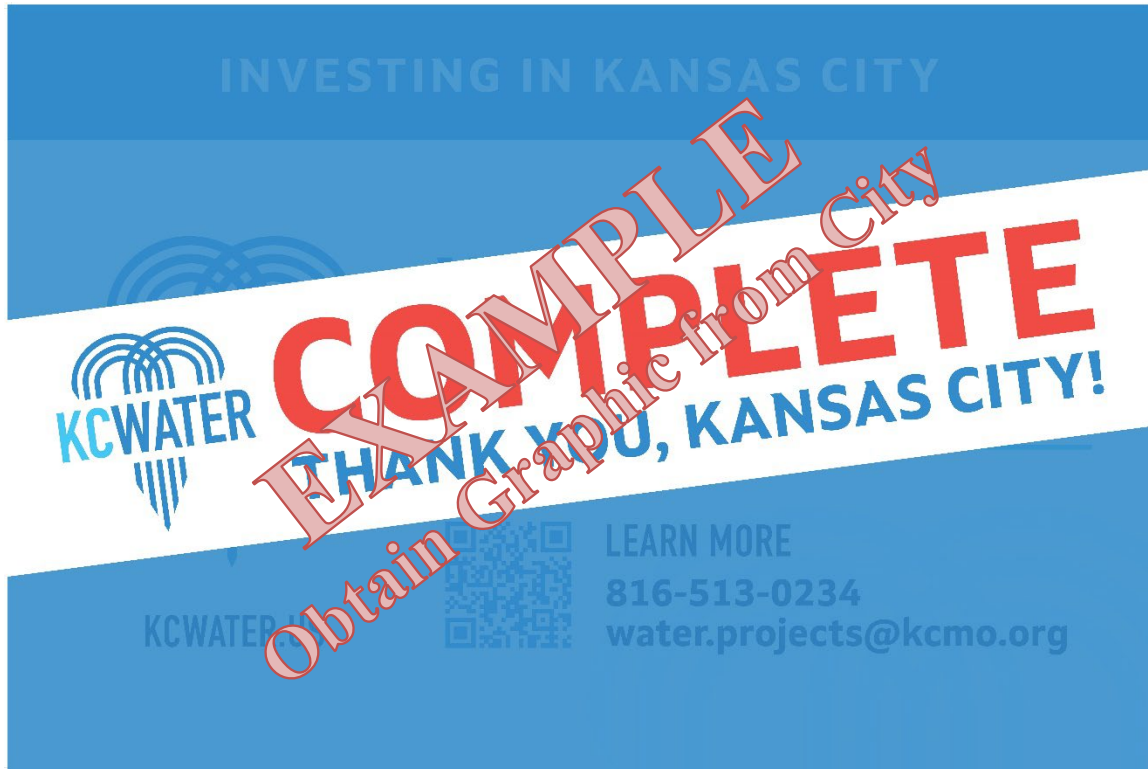
Figure 2 – Post Construction Placard