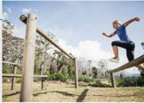
FITNESS OBSTACLE COURSE