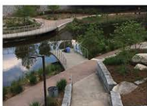
SEATING AND OVERLOOKS