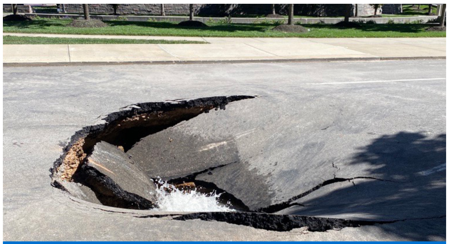
This water main break at 12th and Locust is why it is so important to invest in Kansas City's infrastructure. While repairing the water main break, crews discovered a collapsed combination sewer main.

our monthly KC Water bill is more than just a bill for the water you use each day to drink, wash dishes, and bathe. It also covers two other services important to any community: Stormwater and Wastewater.